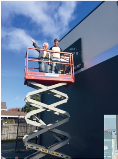
Scissor-lift for our build and lighting crews