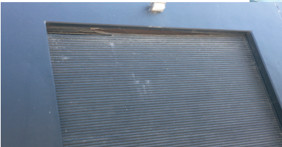
Current Project Replacing old, rusting roll-up door on north side.