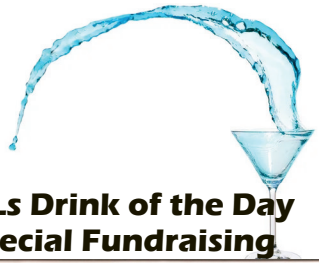
LOLs Drink of the Day Special Fundraising