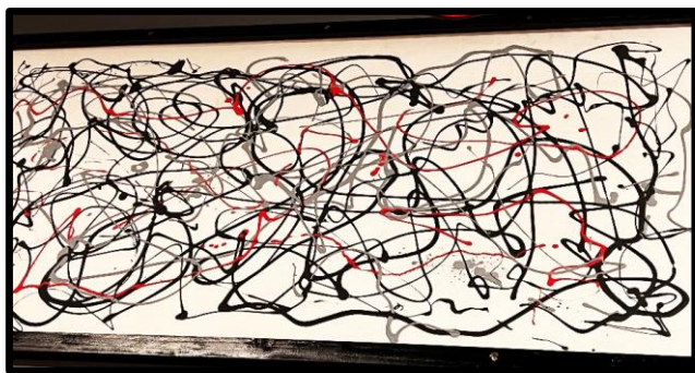
“Bing Bing” 5’ x 3’