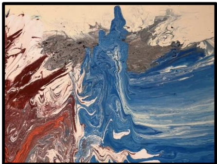
“Boeing Boeing” 4.5’ x 3’

You can bid on our set paintings, painted by some of our very own theatre family. (Available for pickup after February 18 th )