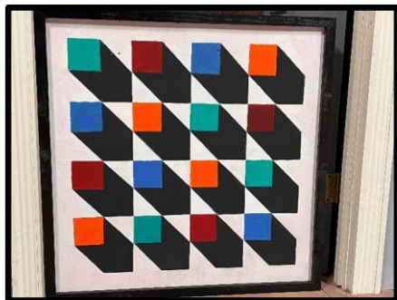
“Boing Boing” 2.5’ x 2.5’